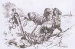
"A bit too soon to take to the Fair."

So many of our volunteers expressed how enjoyable and informative it was to chat with the Brampton Fair-goers. Our very sincere thanks goes to the twenty five people who each did a four hour shift at the fair.