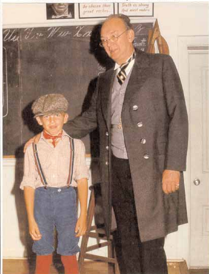
A Tribute to The Old Britannia Schoolhouse's First Schoolmaster, page 2.