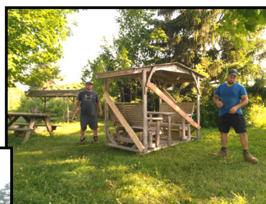
Set in place