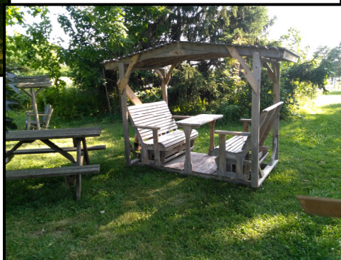
Ready to enjoy